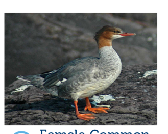
Female Common Merganser